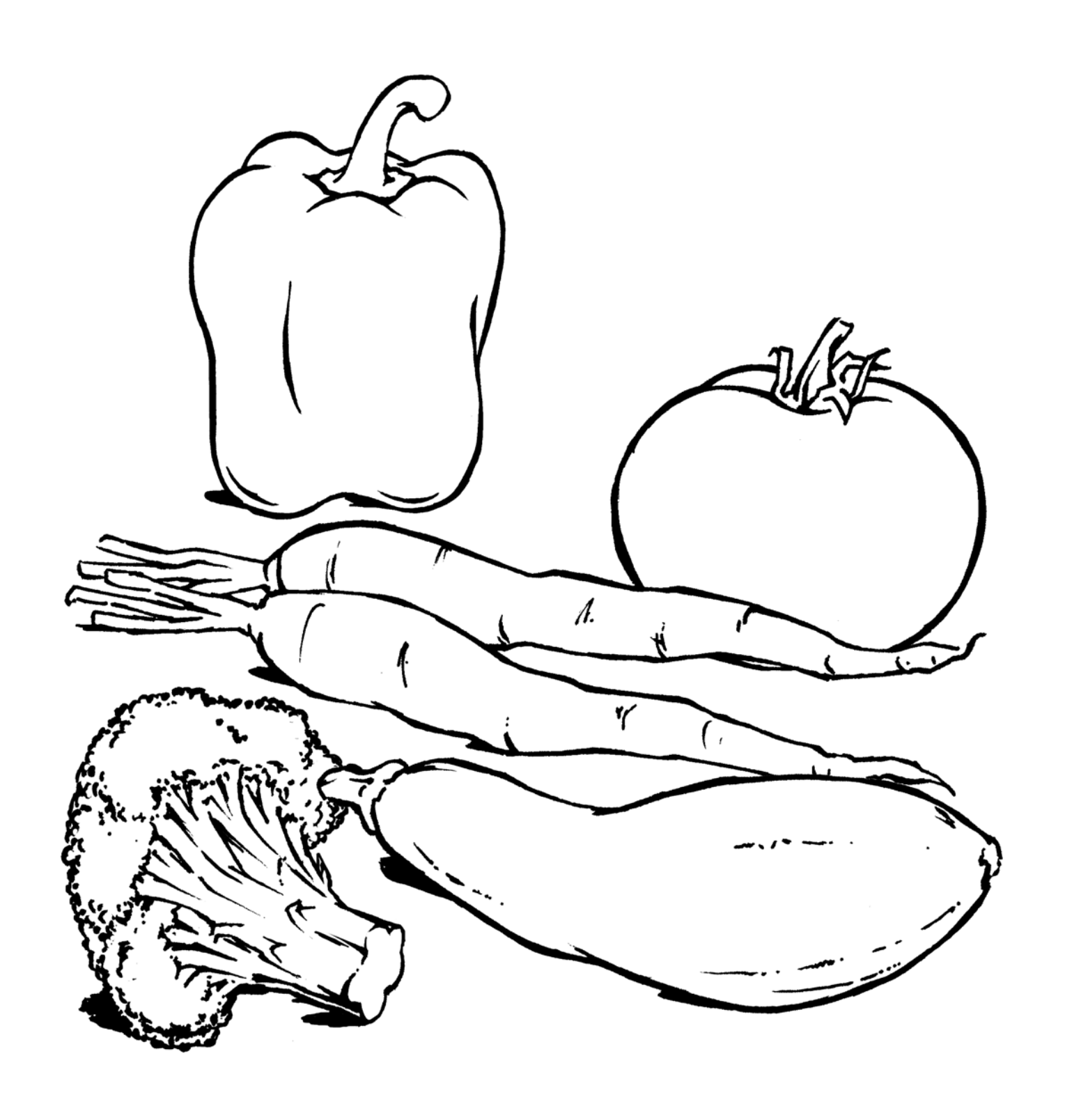
Eat at least 4 vegetables each day.