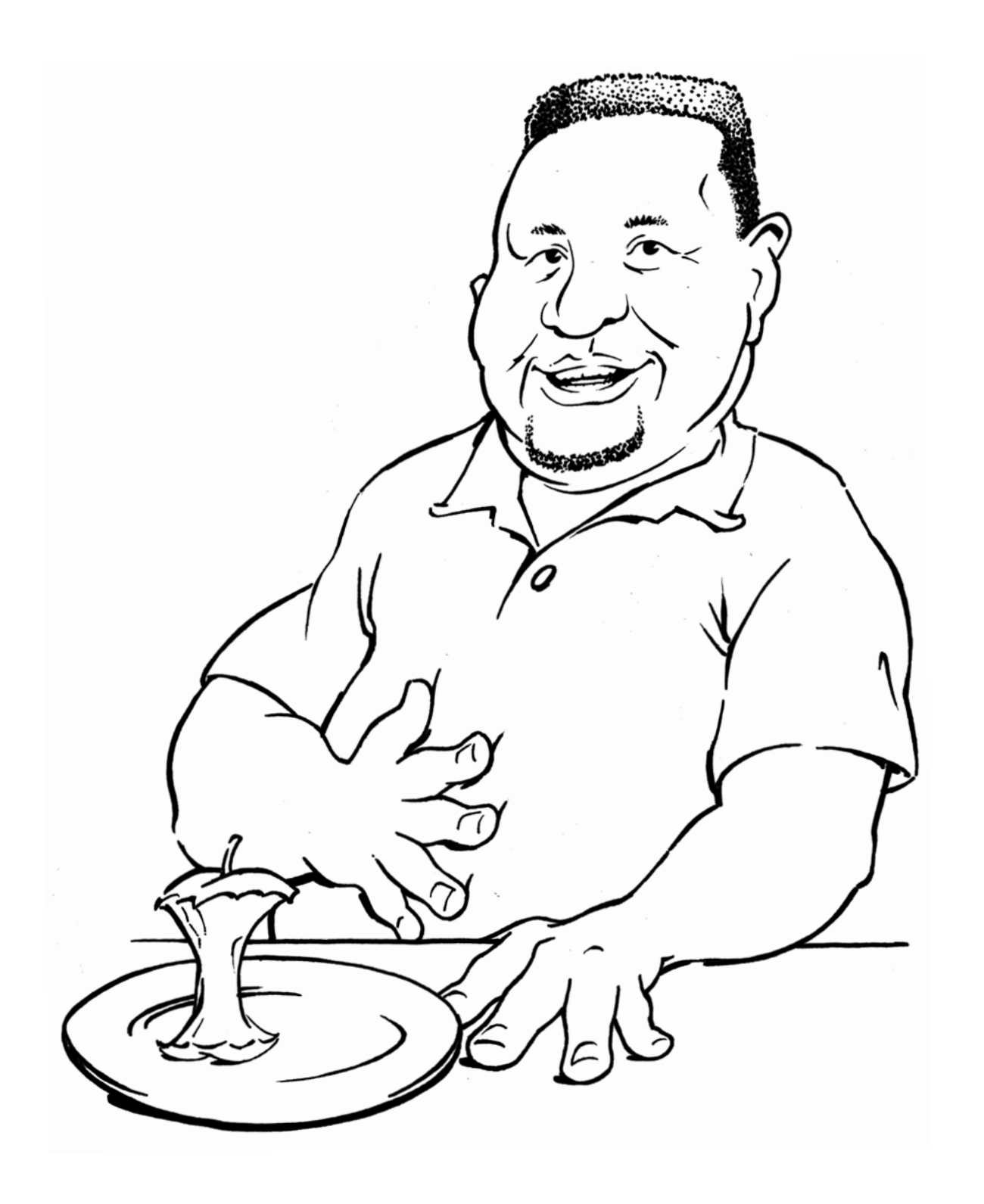
Fiber makes you feel full.