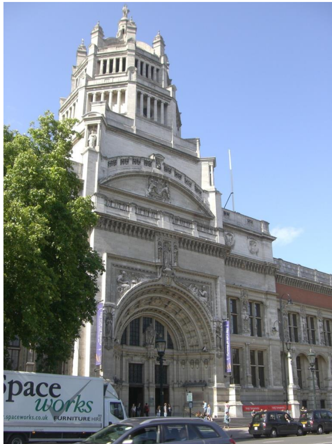
The Victoria and Albert Museum, South Kensington entrance*

The Victoria and Albert Museum – Originally built in 1857, the Victoria and Albert Museum has been a staple in South Kensington for nearly two centuries. Known as one of the best fine and decorative arts museums in the world, the V&A has galleries displaying architecture, Indian art, jewelry, fashion and textiles. The newly renovated fashion gallery opened in 2012. The fashion and textiles department has a vast collection of items, ranging from a woman's embroidered jacket of the early 16 th century to ballgowns by Zac Posen from the 21 st century. The recently renovated jewelry gallery is worth a visit as well. Highlights of the jewelry collection include numerous diamond tiaras and a display of rings, showing the wide range of gemstones available. The V&A is the National Collection of Art and Design and has continually sought to inspire and inform its visitors through retaining close links with the creative industries (Black, 2009). Located on Cromwell Rd., South Kensington station.