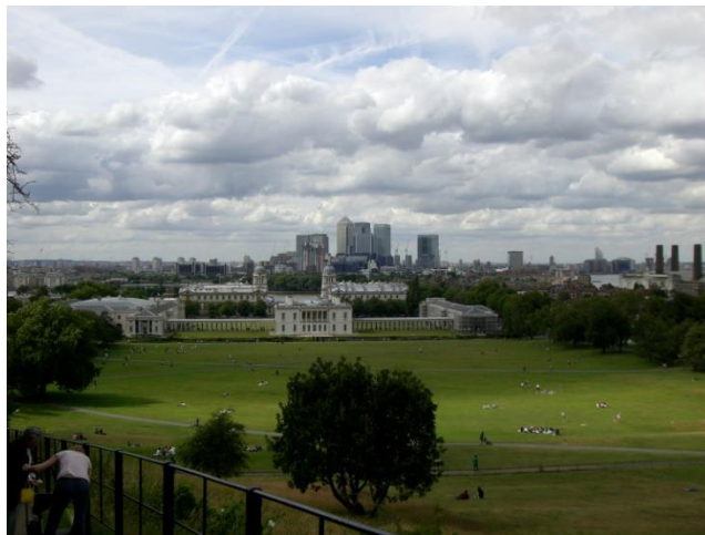
View from the Royal Observatory, near the Greenwich Market*