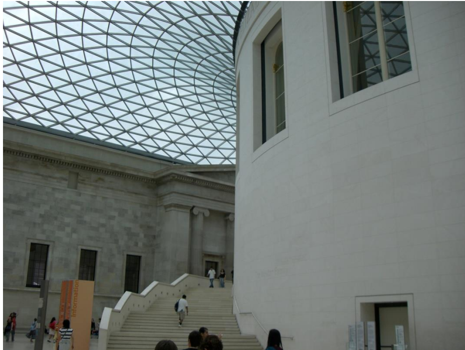
Inside the British Museum*