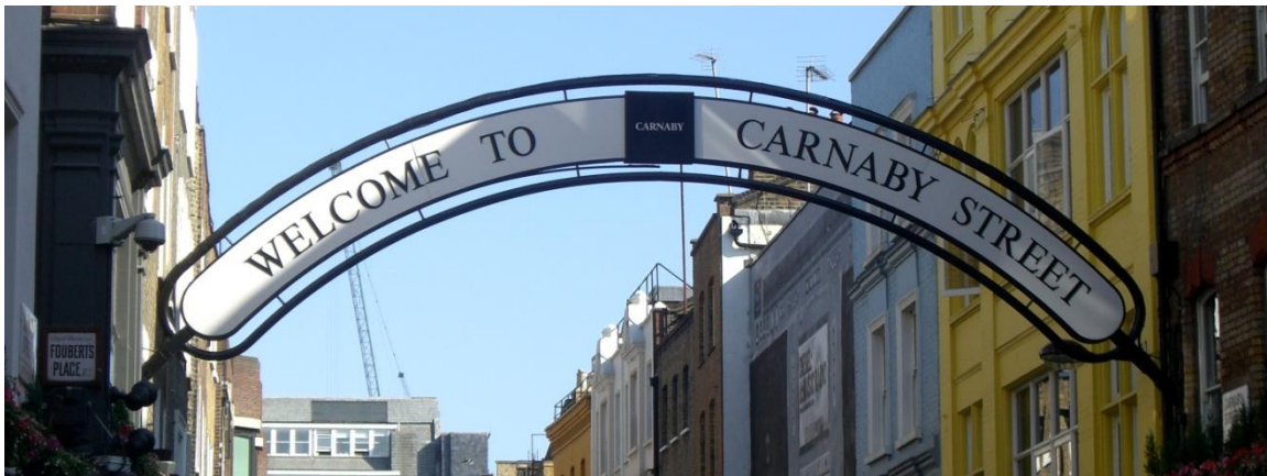
Sign welcoming visitors to Carnaby Street*

Carnaby Street – A phenomenon of the 1960s, Carnaby Street played a role in the mod and hippie styles of the time. Many independent fashion boutiques and designer boutiques, like those for Mary Quant, Marion Foale and Sally Tuffin and Irvine Sellars, were located on Carnaby Street. Carnaby Street was also known for its underground music scene, with bars such as the Roaring Twenties showcasing up and coming bands. Bands like the Rolling Stones and The Who would show up on Carnaby Street to work, shop and socialize, thus making Carnaby Street one of the hippest destinations in Swinging London of the 1960s (Black, 2009).