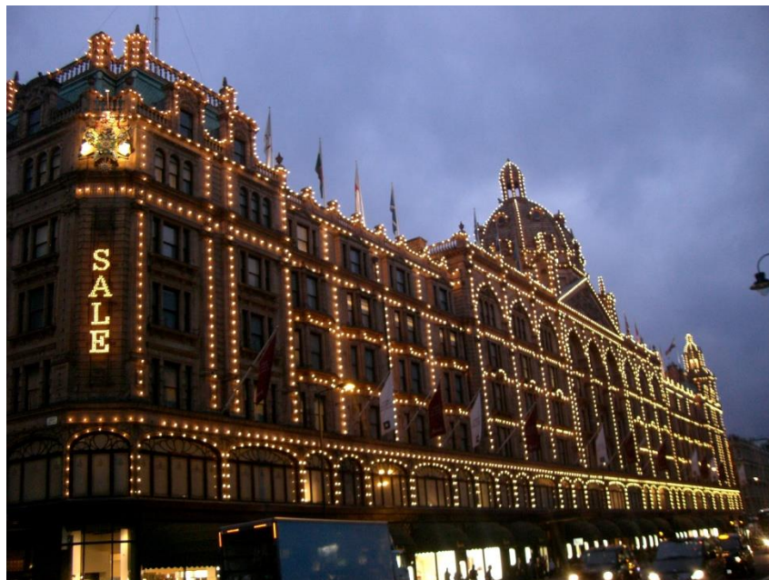
Harrods in Knightsbridge*