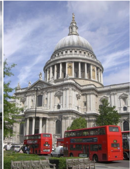
Parliament and St. Paul's Cathedral