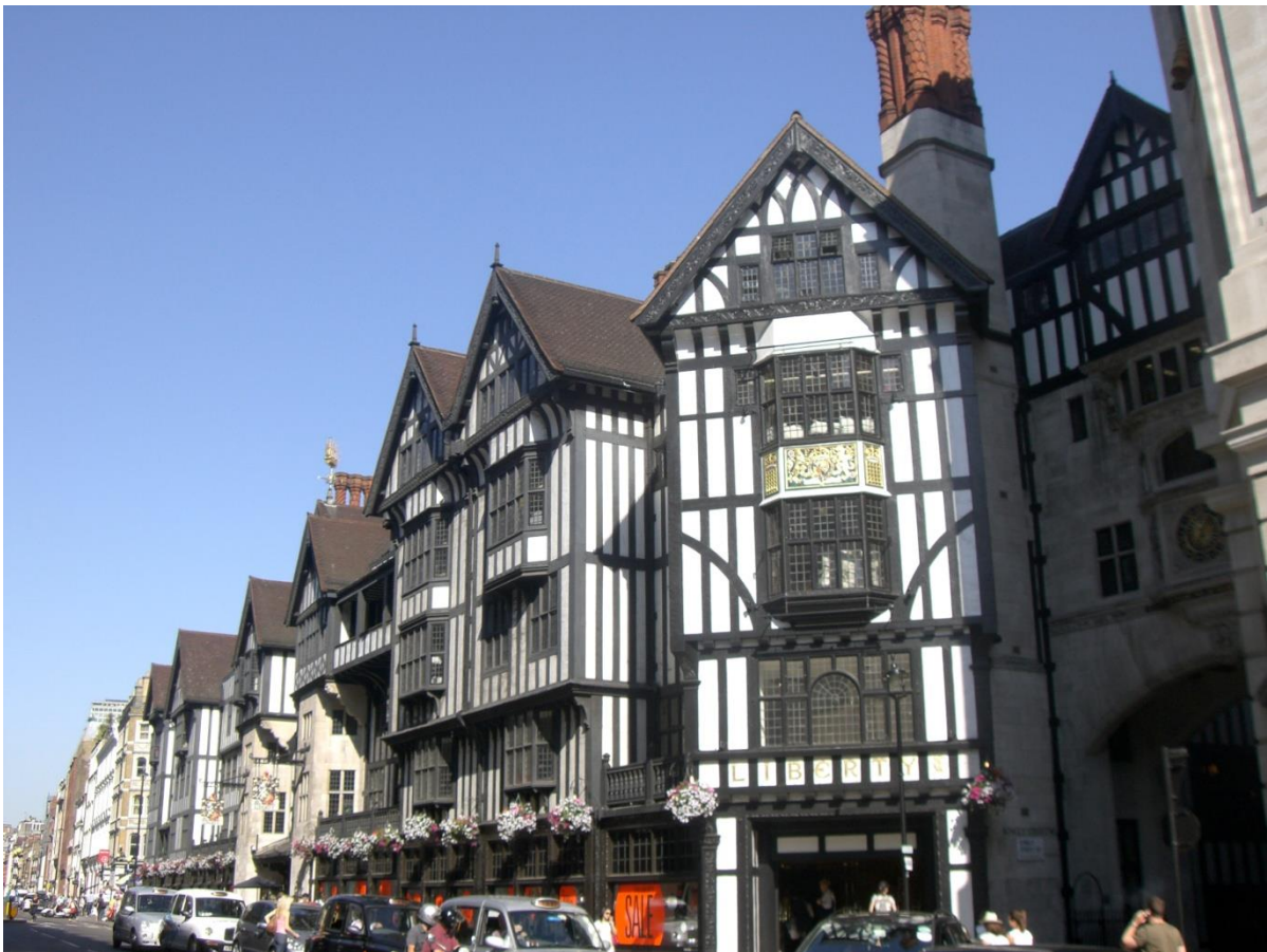
Tudor Style Front of Liberty's off Great Marlborough Street*

Liberty – Opened in 1875, Liberty is a well-known department store located near Regent's Street in central London. The store originally sold ornaments, fabric and objects of art from Japan and the East. Originally named Chesham House, after the childhood home of the owner, Arthur Liberty, the store has been the destination of choice for sophisticated shoppers for well over a century. Liberty is often associated with luxury and great design. In 1884 the store began to carry clothing as well as producing clothing in-house as an attempt to challenge the fashions of Paris. By 1885, the store expanded both in size and in the merchandise carried by selling carpets and furniture. At this time, the store became the most fashionable place to shop and the iconic Liberty fabrics were used for both clothing and furnishing. The Tudor style architecture of the Liberty store, which can still be seen today, was built in 1924 out of timbers from two ships: the HMS Impregnable and the HMS Hindustan. The front of the store at Great Marlborough Street is the same length of the HMS Hindustan. Continuing through the 20 th century, Liberty carries both contemporary and traditional designs throughout the store (Liberty of London).